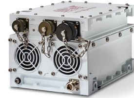
Models 4780 and 4710H 80/100 watt C-band GaN BUCs for satellite uplink applications

Backed by over 35 years of satellite communications experience, and CPI's worldwide 24-hour customer support network that includes more than 20 regional factory service centers.